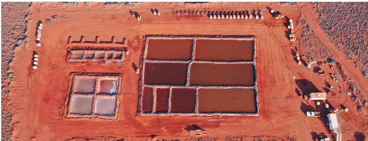
Figure 1: Small-scale Evaporation Ponds

BCI is finalising preparations for commencement of a A$12M large-scale trial pond programme, which includes a 32-hectare pond with 2.3km of pond walls and the seawater pump station. The main objective of this work is to de-risk final pond construction by testing and confirming pond wall designs as well as the construction methodology, equipment, materials and costs.